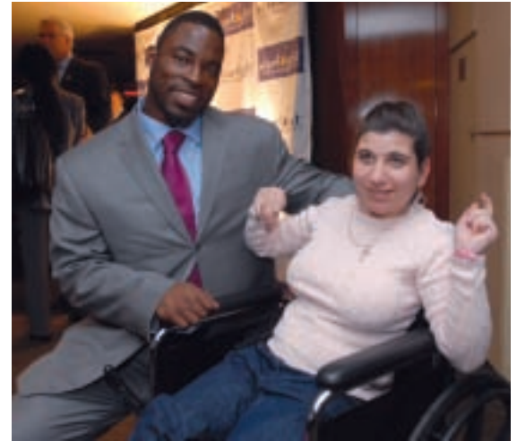
JUSTIN TUCK WITH STARLIGHT TEEN