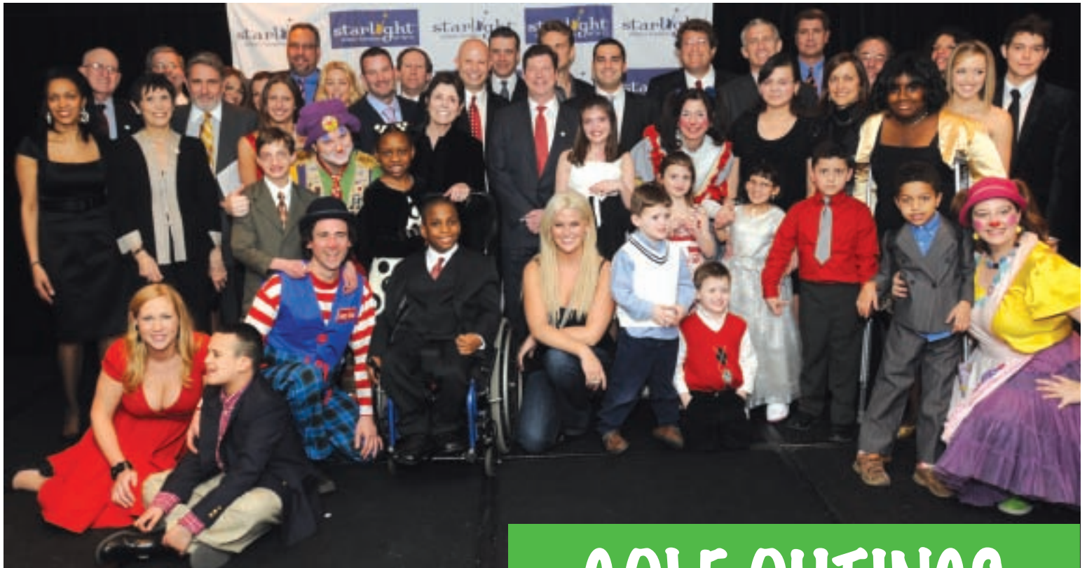
STARLIGHT BOARD OF DIRECTORS, CHILDREN & CELEBRITY SUPPORTERS AT THE 24TH ANNUAL GALA